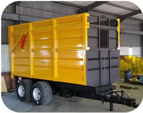
MKULU 1440—40 M/3 Split Bin Silage Trailer