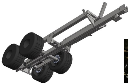
MKULU 1440—Walking beam suspension