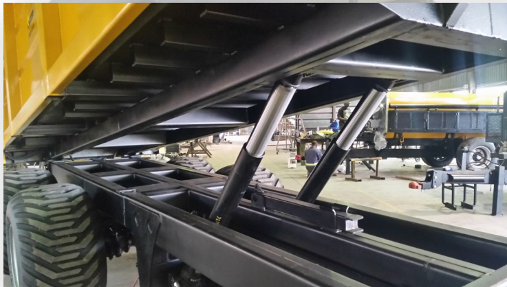
MKULU 1440—Underbody Twin lift Cylinder